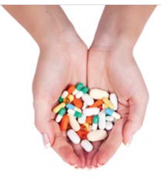
Compliance with medication can be improved through the Medicines Use Review and the New Medicines Service

The researchers point out that their study did have some limitations. It achieved only partial target recruitment. This